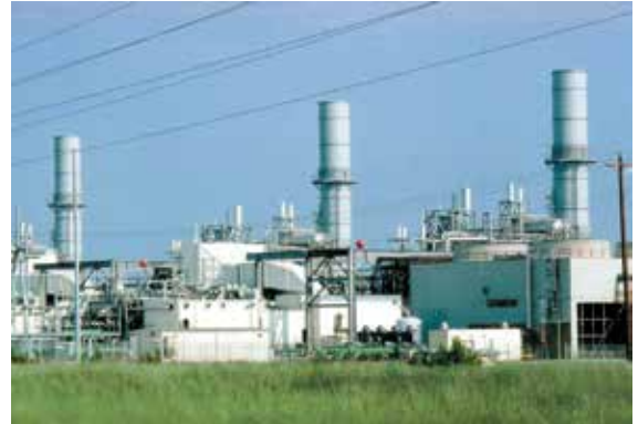
Typical Combined Cycle Power Station