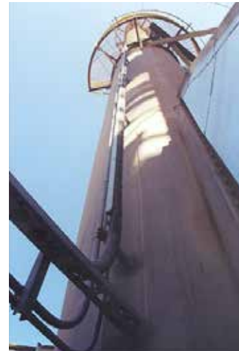
TubeTrace Bundles are ideal for CEMS