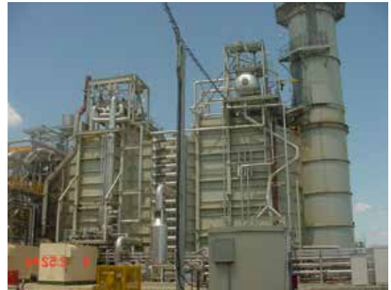
Typical HRSG units capture Combustion Turbine exhaust to generate steam. This is most often used for additional power generation.