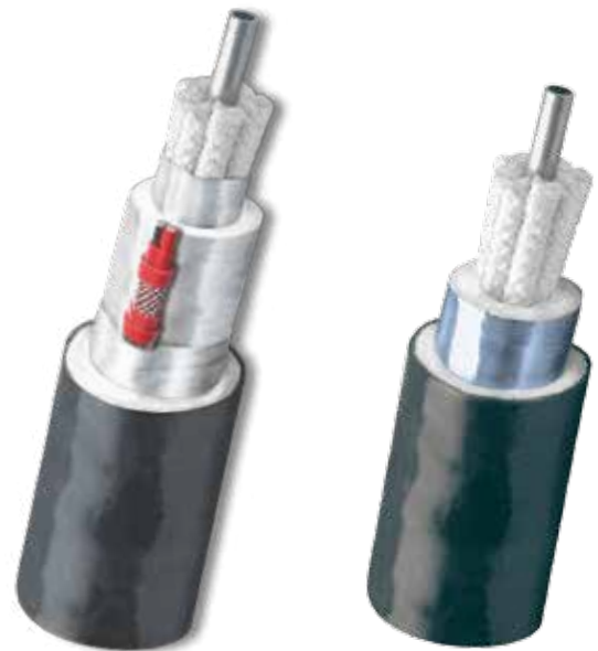
TubeTrace SEI-HT Shown