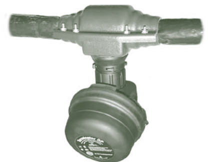
Terminator DP/FAK-4 (shown)